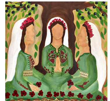
Palestinian Christian women praying