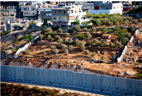
Shuafat Refugee Camp, East Jerusalem 2010