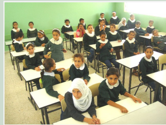
Classroom in Gaza

95% of Palestinian children are enrolled in basic education. There are public and private schools. Most private schools are run by religious institutions. The Christian-run schools serve children of all faiths. The UN Relief and Works Agency for Palestinian Refugees runs schools in the 58 recognised Palestinian refugee camps.