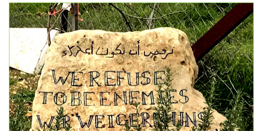
'We refuse to be enemies'

All: Triune God, we confess our weakness and failure to accept others without judging them. We confess that we are not always humble, gentle, patient and loving. Yet we know that we belong to you, our Father God, and ask in your mercy that we would be strengthened to love, to walk humbly and to bear with one another in the challenges we find in our families, our community, our churches and our nation. Amen