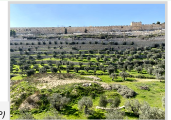
Olive trees outside Jerusalem