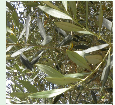
Olive leaves