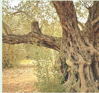
old olive tree branch