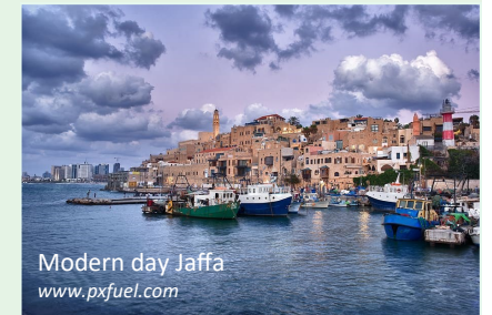
Modern day Jaffa