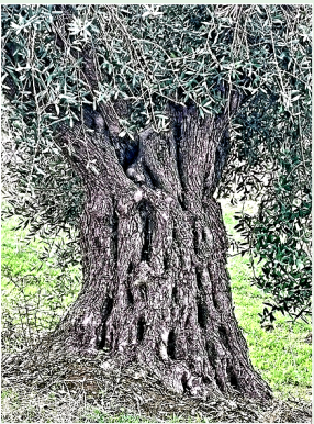
old olive tree